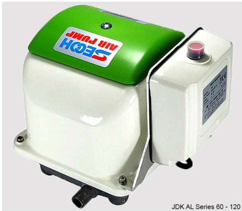
JDK AL Series 60 - 120