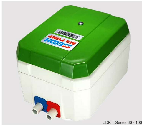
JDK T Series 60 - 100