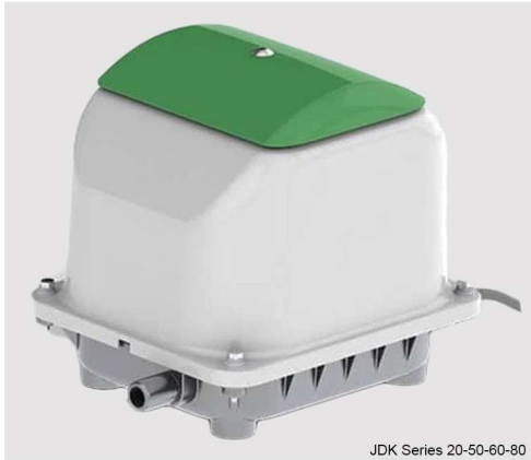
JDK Series 20-50-60-80