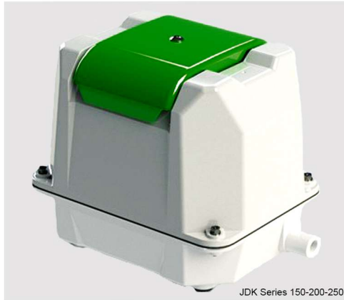
JDK Series 150-200-250