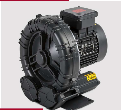
FPZ - MS Series