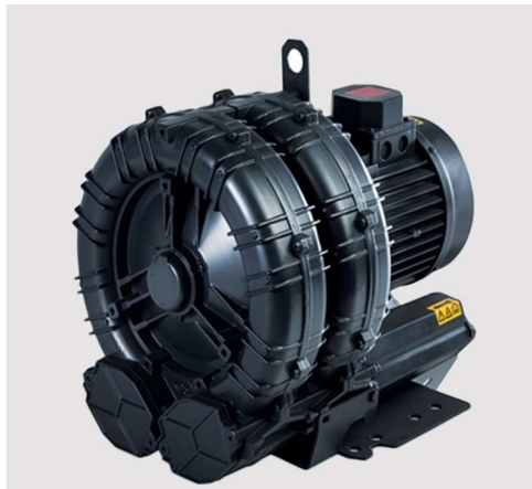
FPZ - TS Series