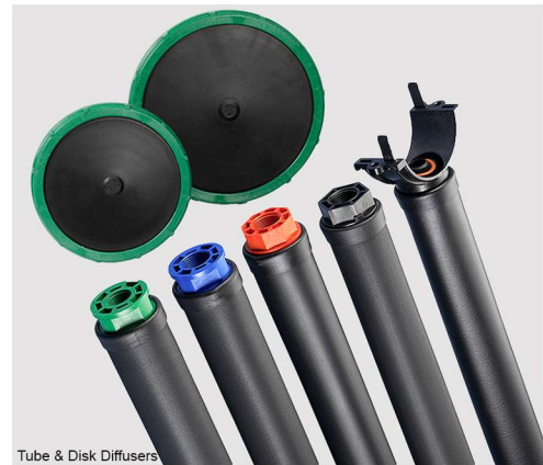
Tube & Disk Diffusers