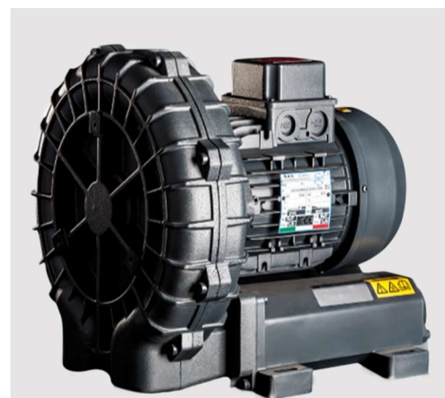
FPZ - MD Series