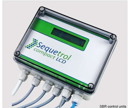
SBR control units